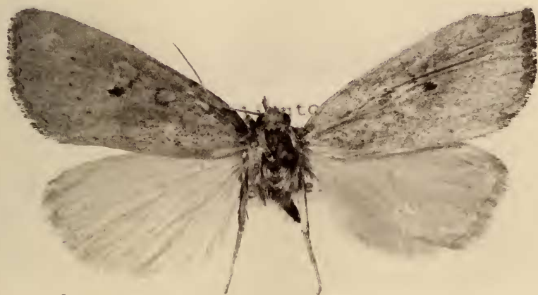
FIG. 1. Spartiniphaga carterae , holotype ♂.

Forewing length: 13.8-15.2 mm ♂♂; 11.7-13.1 mm ♀♀.